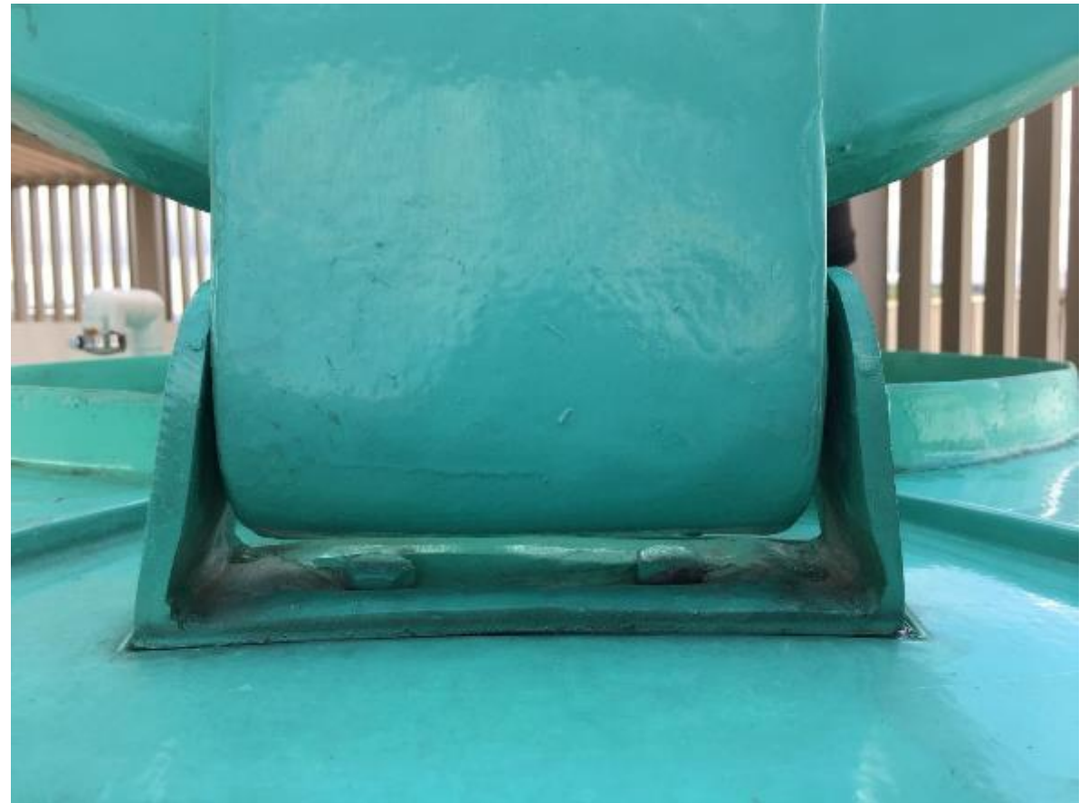
Hinge of tank cover when opened.