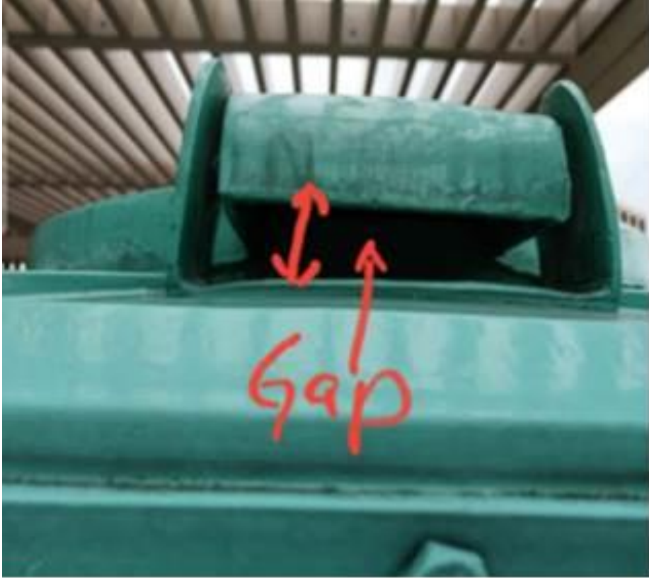
Gap found when tank cover is closed.